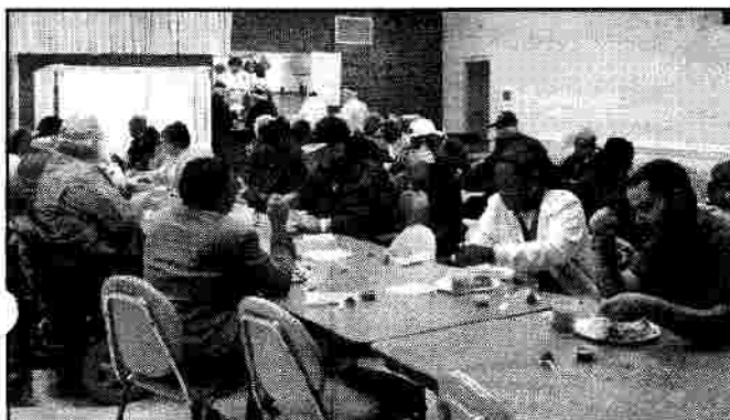
Our guests enjoy a home-cooked meal.